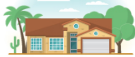
Affordable Home Ownership